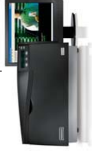
Non-laminating DTC550 shown with Fargo Print Security Manager