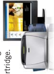
Single-sided DTC400 shown with Print Security Suite