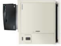
SecureVault 2000 with workstation (above) and the SecureVault 1000 (right).