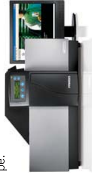
Non-laminating HDP600 shown with Fargo Print Security Manager