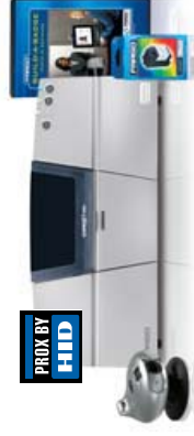
CardJet 410 Photo ID System shown