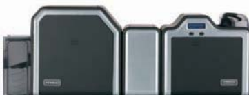
Lamination option and dual-sided printer/encoder

Modular design grows with your needs. Not sure what your ID card applications will require in the future? No problem. The HDP5000 is easily upgraded to fit your needs. Start with a basic single-sided unit. Install encoding modules. Upgrade to dual-sided printing. Add lamination, or simultaneous dual-sided lamination for the ultimate in card security and durability.