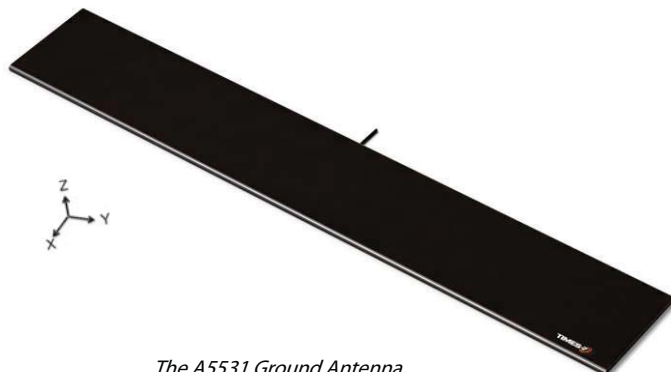
The A5531 Ground Antenna

Our SlimLine range of antennas are unique in the RFID industry; offering high levels of performance & durability in an aesthetically superior form. Proven in a diverse & growing range of markets, applications include: retail & customer interaction, conference & people tracking, race timing, baggage handling, and logistic & supply chain asset management.