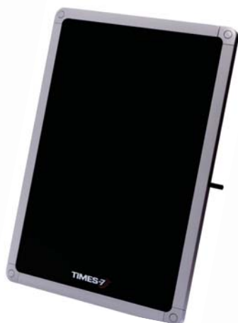
The SlimLine A6032

Our SlimLine range of antennas are unique in the RFID industry; offering high levels of performance & durability in an aesthetically superior form. Proven in a diverse & growing range of markets, applications include: retail & customer interaction, conference & people tracking, race timing, baggage handling, and logistic & supply chain asset management.