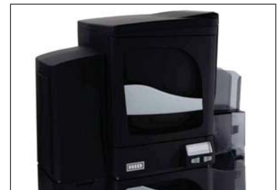
Custom overlaminates are available for a field-upgradable single- or unique, high-speed dual-sided simultaneous laminator.

The DTC4500 easily connects to PCs through its built-in USB and Ethernet ports. With its built-in internal print server, you can install a DTC4500 anywhere on a LAN for greater freedom when you are planning widespread or high-volume card issuance. Additionally, the DTC4500 is fully compatible with most ID card personalization software, including Asure ID®, which offers unique capabilities when used with HID FARGO printers.