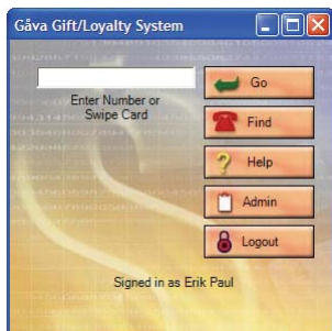
Main Menu: Easy to use and easy to learn interface completely eliminates the needs for multiple clicks, keystrokes or special codes of any kind

GávaEL makes updates a snap with SmartUpdate. Simply starting the GávaEL software insures that updates are installed and available to you. No need for your IT staff to do the work!