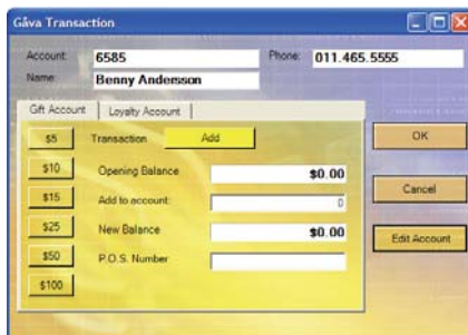
Transaction Gift: Color coded dialogs make for quick and easy processing reducing the wait at check-out to mere seconds