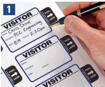
1 Visitor signs in on badge.