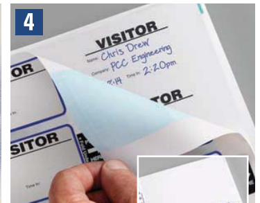
4 The optional duplicate record tracks your visitors automatically.

Inset: The badge expires overnight so it can't be reused.