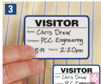
3 Visitor wears badge for easy identification.

Inset: The badge expires overnight so it can't be reused.