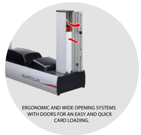
ERGONOMIC AND WIDE OPENING SYSTEMS WITH DOORS FOR AN EASY AND QUICK CARD LOADING.