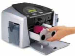
DTC400e single-sided printer

Designed for easy operation and hassle-free maintenance. The Fargo DTC400e features an all-in-one ribbon cartridge that combines a printer ribbon and card cleaning roller into one convenient unit. Just slide in the cartridge, close the door, and you're done. No feeding or tearing ribbon rolls, no fumbling with separate cleaning rollers. The integrated cartridge ensures that you'll change the cleaning roller with every ribbon change — a critical step to ensuring high-quality printing of conventional and rewritable cards.