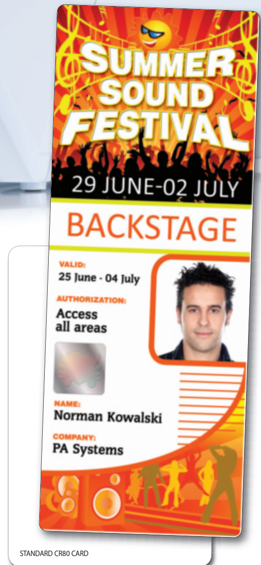
STANDARD CR80 CARD

Magicard's patented HoloKote® security technology adds a watermark to the card as it is printed - it requires no additional consumables and can be customized to an individual logo design - enabling true security at no extra cost.